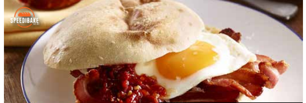
SPEEDIBAKE SOFT TURKISH ROUND LUNCH ROLL 70 x 130g VEGAN TTFS CODE 9423