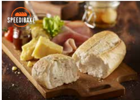
SPEEDIBAKE LARGE SANDWICH SUB WHITE - PAR BAKE 36 x 160g VEGAN TTFS CODE 9670