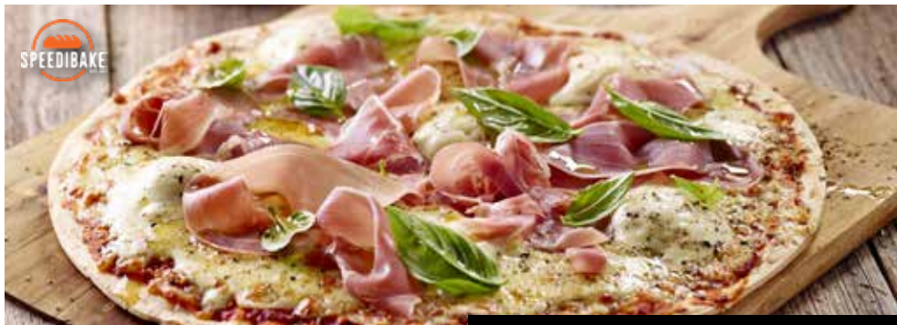
SPEEDIBAKE PIZZA BASE 12" 20 x 220g VEGAN TTFS CODE 8960