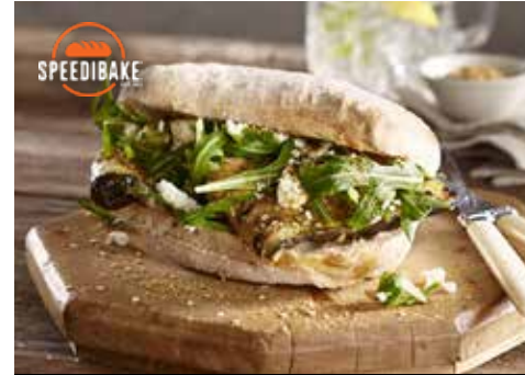
SPEEDIBAKE RUSTIC CIABATTA LUNCH ROLL 50 x 190g VEGAN TTFS CODE 9823