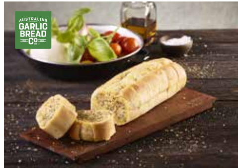
AUSTRALIAN GARLIC BREAD CO. AGB GARLIC BREAD CATERING 11" SINGLE 32 x 225g VEGAN TTFS CODE 5501