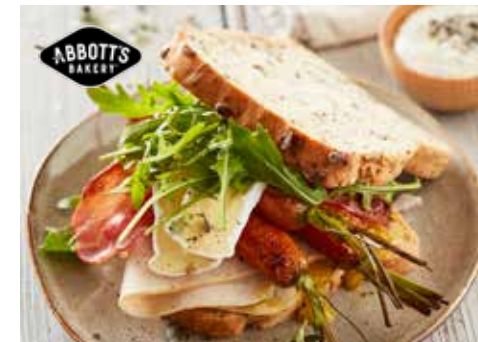
ABBOTT'S BAKERY GLUTEN FREE MIXED SEEDS