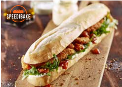
SPEEDIBAKE HALF BAGUETTE WHITE - PAR BAKE 52 x 130g VEGAN TTFS CODE 9606