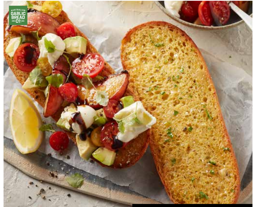
AUSTRALIAN GARLIC BREAD CO. AGB 8" SOURDOUGH GARLIC BREAD 40 x 8" 100g pieces VEGAN TTFS CODE 5642