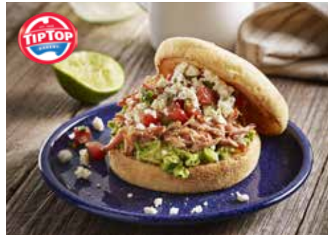
TIP TOP ENGLISH MUFFINS