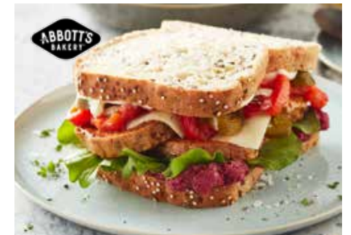
ABBOTT'S BAKERY GLUTEN FREE SOY-LINSEED