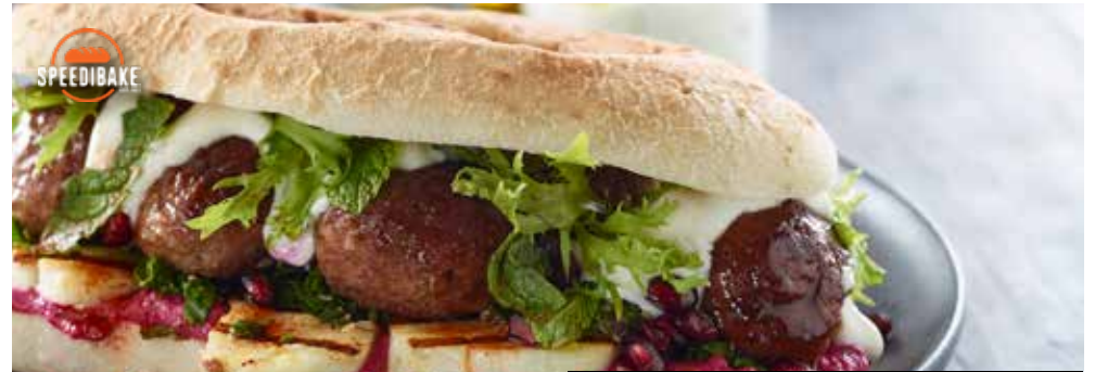
SPEEDIBAKE SOFT TURKISH OVAL LUNCH ROLL 38 x 110g VEGAN TTFS CODE 9424