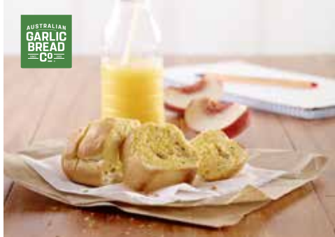
AUSTRALIAN GARLIC BREAD CO. AGB GARLIC BREAD FOR ONE 4.5" 48 x 85g VEGAN TTFS CODE 5645