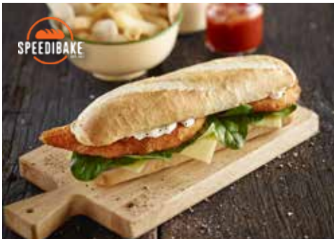
SPEEDIBAKE LARGE SANDWICH SUB WHITE 36 x 160g VEGAN TTFS CODE 9955