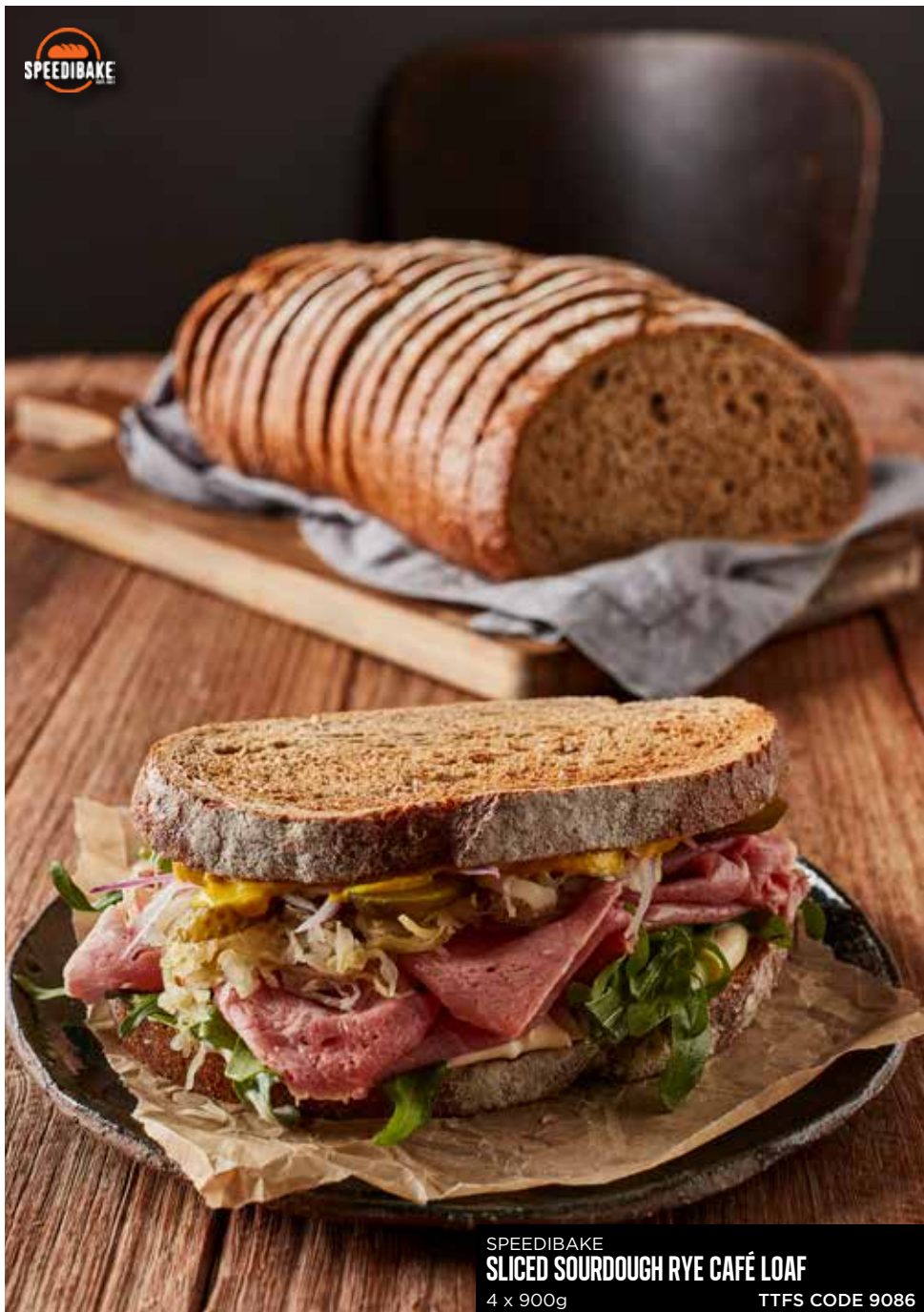
SPEEDIBAKE SLICED SOURDOUGH RYE CAFÉ LOAF 4 x 900g TTFS CODE 9086