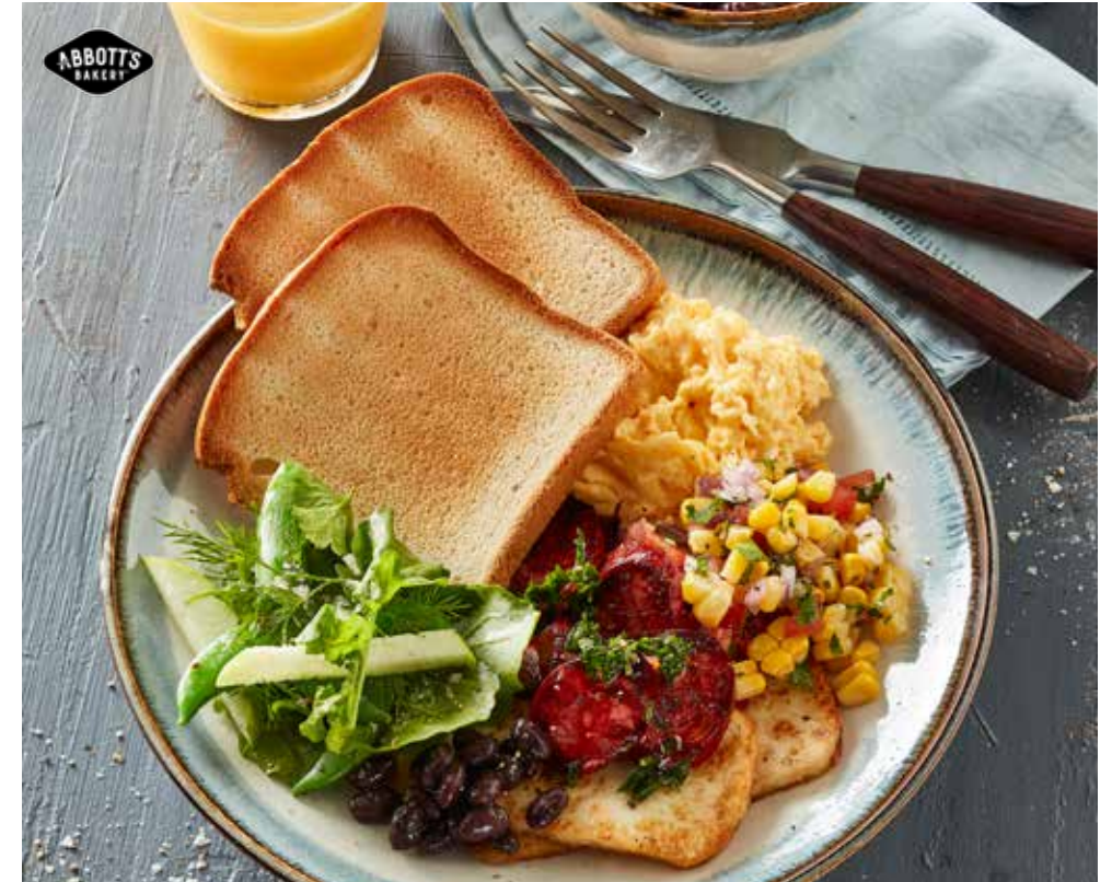
ABBOTT'S BAKERY GLUTEN FREE WHITE