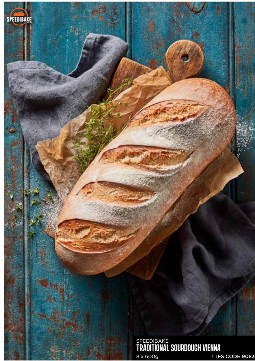
SPEEDIBAKE TRADITIONAL SOURDOUGH VIENNA 8 x 600g TTFS CODE 9083