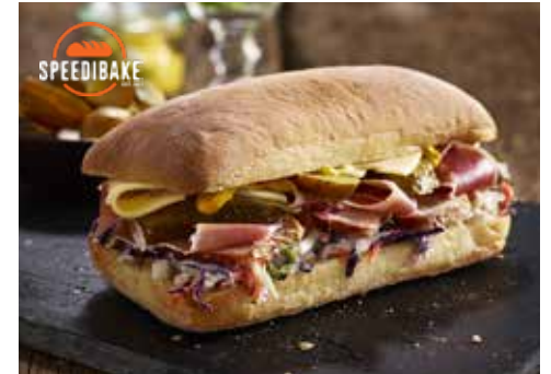
SPEEDIBAKE PANINI LUNCH ROLL 48 x 100g VEGAN TTFS CODE 9422