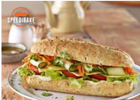
SPEEDIBAKE LARGE SANDWICH SUB MULTIGRAIN 36 x 160g VEGAN TTFS CODE 9623