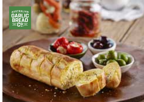
AUSTRALIAN GARLIC BREAD CO. AGB GARLIC BREAD CATERING 9" SINGLE 40 x 170g VEGAN TTFS CODE 5509