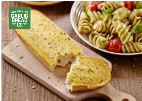
AUSTRALIAN GARLIC BREAD CO. AGB GARLIC BREAD SUB 9" TWIN PACK 40 x 9" 125g pieces VEGAN TTFS CODE 5510