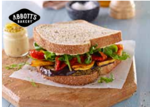
ABBOTT'S BAKERY FARMHOUSE WHOLEMEAL