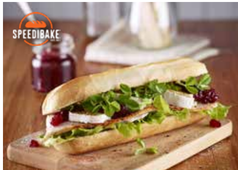
SPEEDIBAKE MEDIUM SANDWICH SUB WHITE 60 x 110g VEGAN TTFS CODE 9528