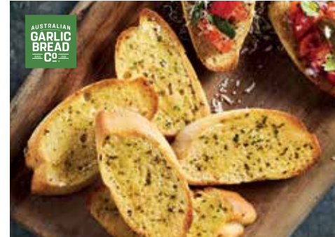
AUSTRALIAN GARLIC BREAD CO. AGB GARLIC SLICES 144 x 26g VEGAN TTFS CODE 5589