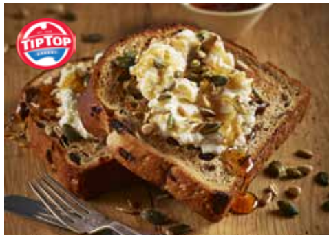
TIP TOP SUPER THICK RAISIN SLICE