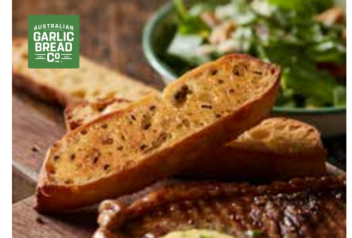
AUSTRALIAN GARLIC BREAD CO. AGB CIABATTA GARLIC SLICES 80 x 70g VEGAN TTFS CODE 5640