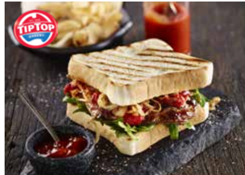
TIP TOP SUPER THICK WHITE SLICED