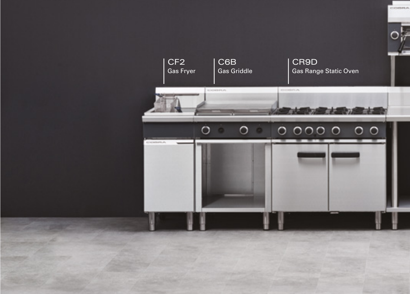
A SUGGESTED CAFÉ LINEUP