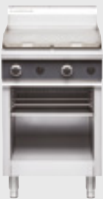
CT6 600mm Gas Griddle Toaster