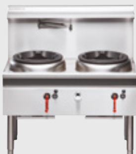
CW2H 1200mm Two Hole Gas Waterless Wok

W 600mm D 800mm H 771mm INCL. SPLASHBACK 1280mm