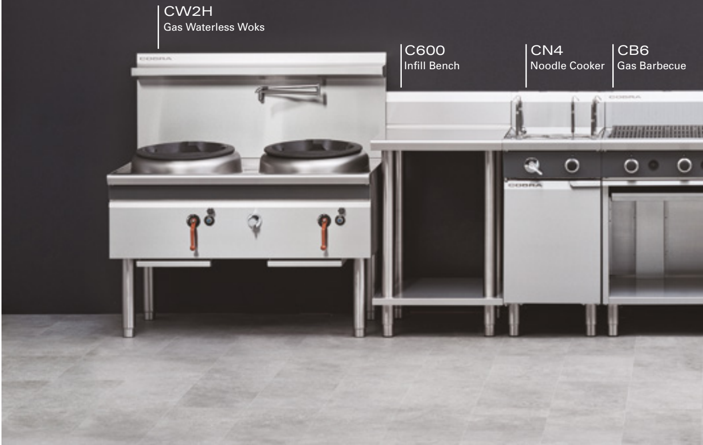
A SUGGESTED FUSION RESTAURANT LINEUP