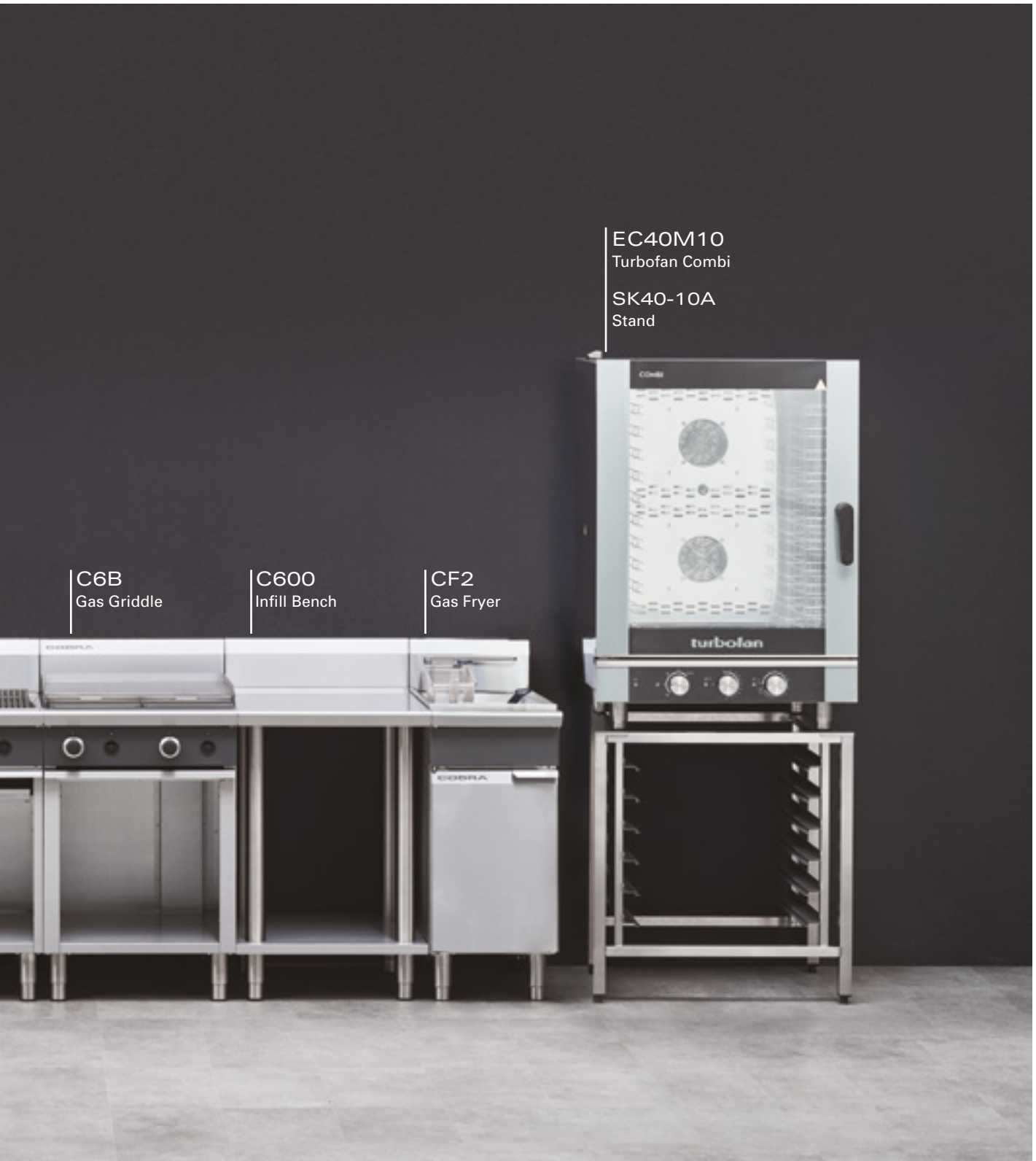
C6B Gas Griddle