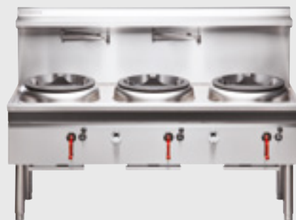
CW3H 1800mm Three Hole Gas Waterless Woks

W 1200mm D 800mm H 771mm INCL. SPLASHBACK 1280mm