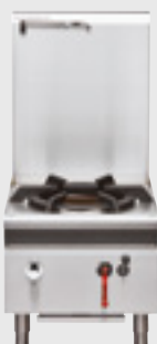
CSP6 600mm Gas Waterless Stockpot