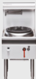
CW1H 600mm One Hole Gas Waterless Wok

CW1H-C 1 Hole, 1 Chimney Burner CW1H-D 1 Hole, 1 Duckbill Burner