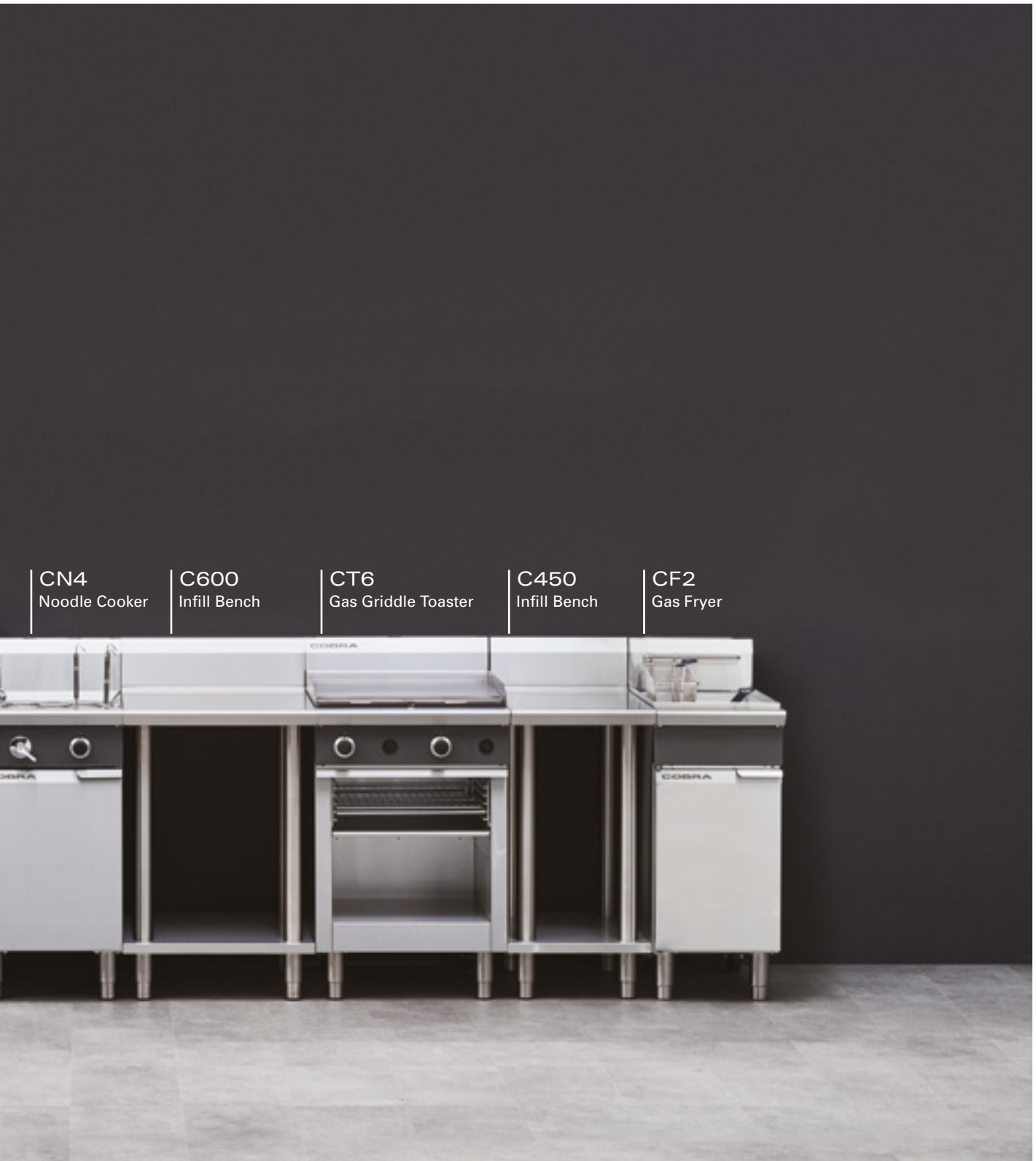
CN4 Noodle Cooker