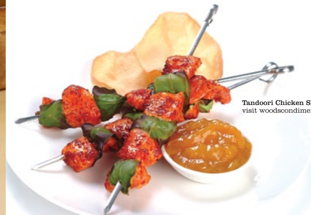
Tandoori Chicken Skewers with Apricot & Mango Chutney - visit woodscondiments.com.au for full recipe