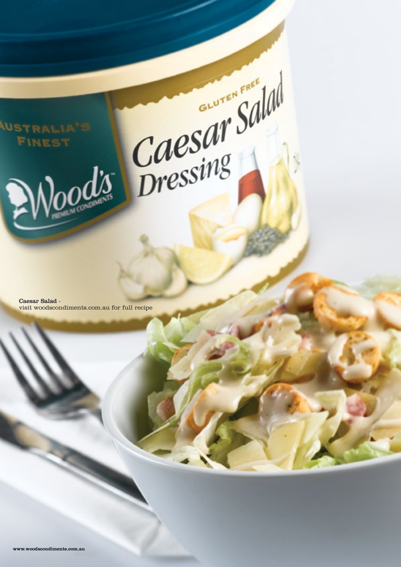
Caesar Salad - visit woodscondiments.com.au for full recipe