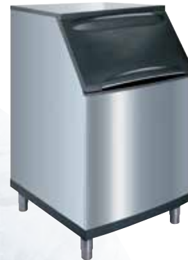
B-Style Ice Storage Bins

Available in 22" (55.9 cm), 30" (76.2 cm) and 48" (121.9cm) widths.