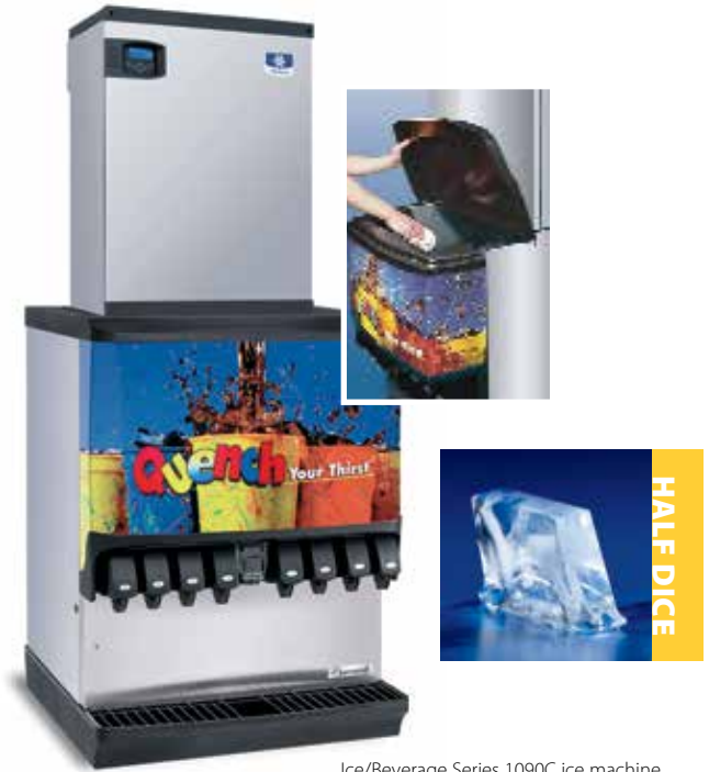
Ice/Beverage Series 1090C ice machine on Servend SV-250 beverage dispenser

This compact Ice/Beverage Series ice machine is available in high volume ice production capacities to satisfy nearly every beverage dispenser application at quick service restaurants, convenience stores, recreational or educational foodservice operations.