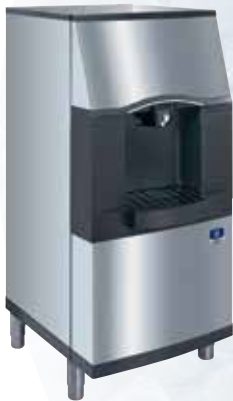
SPA and SFA Series Ice Dispensers

Featuring one-piece corrosion-free composite-resin base, impact-resistant polyethylene bin liner, soft durameter trim that helps silence bin closing, internal scoop holder and protectant bumper guards.