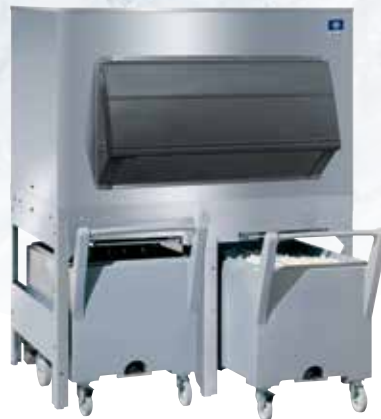
Ice Storage Bin and Cart System

Equipped with ice gate for increased employee safety, easier ice removal, and reduced spillage. The 30" (76.2 cm) model is one of the smallest footprint large capacity storage bins available.