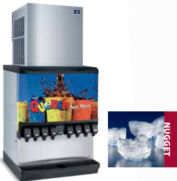
RNS-0308 nugget ice machine on Servend® SV-250 beverage dispenser