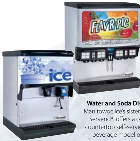
Water and Soda Dispensers Manitowoc Ice's sister company, Servend®, offers a complete countertop self-service ice and beverage model offering.

Find the perfect ice machine pairing with Manitowoc® Ice's wide variety of ice storage bins and dispensers.