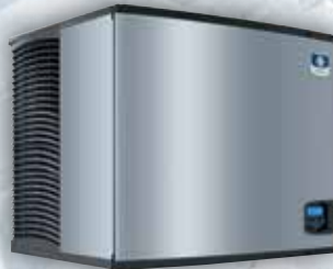
Modular Ice Machines

Featuring high-volume dispensing with patented "push-for-ice" rocking chute dispense mechanism and paddle wheel technology.