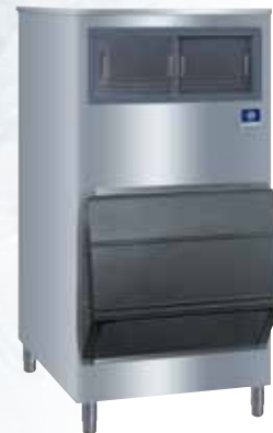
F-Style Large Capacity Ice Storage Bins

Available in 22" (55.9 cm), 30" (76.2 cm) and 48" (121.9 cm) widths.