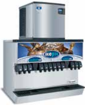
i-322 ice machine on Servend® MDH-302 beverage dispenser

Manitowoc® Ice dice or half dice cubes crushed into small pieces using a Maniowoc Ice machine and a Servend® beverage dispenser equipped with icepic® ice crusher. Provides a selection of crushed or cubed ice from a single ice maker/ice-beverage dispenser combination. Maximum cooling with nearly 100% ice to water ratio.