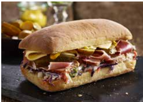
SPEEDIBAKE PANINI LUNCH ROLL