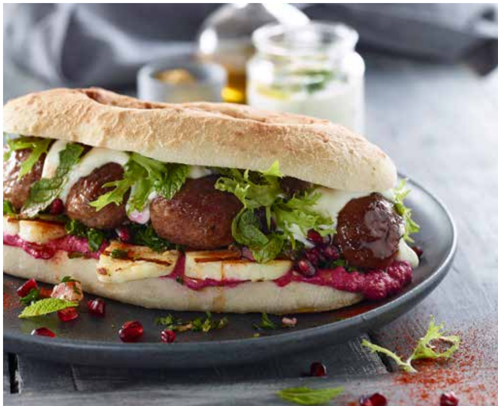
SPEEDIBAKE SOFT TURKISH OVAL LUNCH ROLL