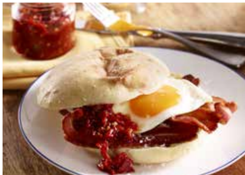
SPEEDIBAKE SOFT TURKISH ROUND LUNCH ROLL