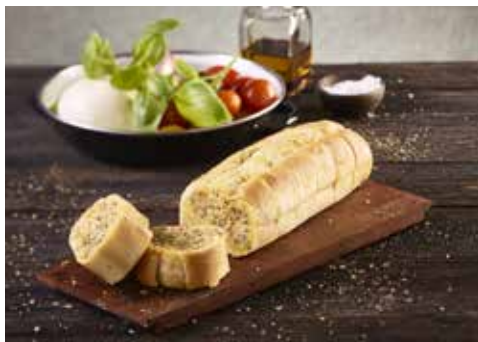
AGB GARLIC BREAD CATERING 11" SINGLE 32 x 225g