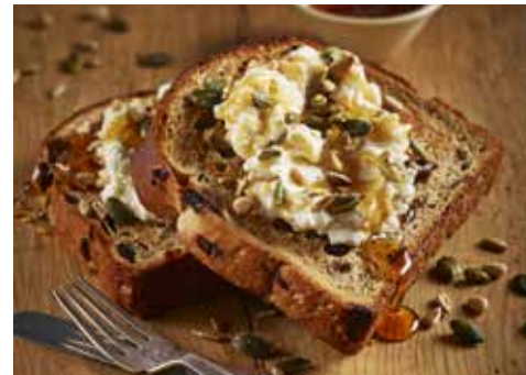
TIP TOP SUPER THICK RAISIN SLICE