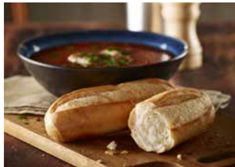
SPEEDIBAKE LARGE DINNER ROLL WHITE