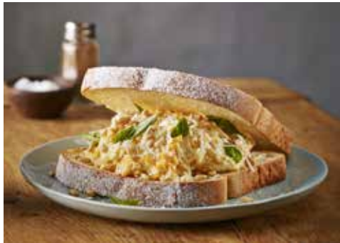
ABBOTT'S BAKERY RUSTIC WHITE