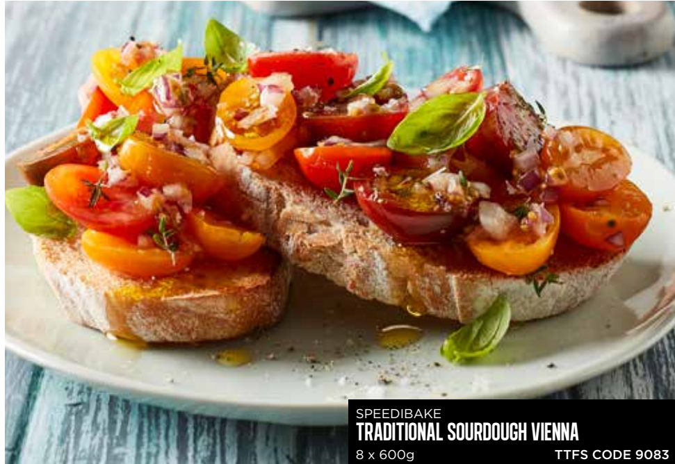
SPEEDIBAKE TRADITIONAL SOURDOUGH VIENNA 8 x 600g TTFS CODE 9083