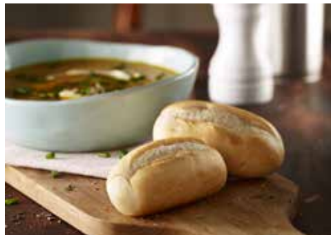
SPEEDIBAKE SMALL DINNER ROLL WHITE