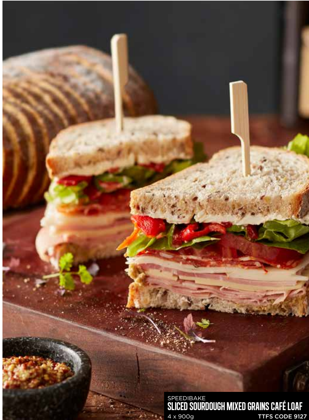
SPEEDIBAKE SLICED SOURDOUGH MIXED GRAINS CAFÉ LOAF 4 x 900g TTFS CODE 9127

✓ 10 YEAR CULTURE ✓ 24 HOUR BULK FERMENTED ✓ HAND-MOULDED & SCORED