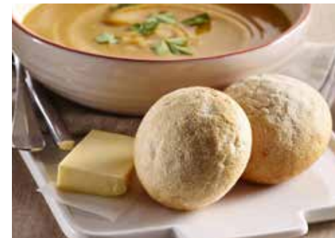
SPEEDIBAKE SOURDOUGH ROUND DINNER ROLL/SLIDER