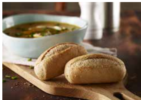
SPEEDIBAKE DINNER ROLL BROWN