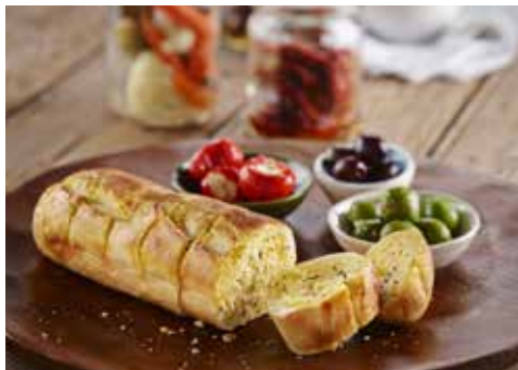
AGB GARLIC BREAD CATERING 9" SINGLE 40 x 170g