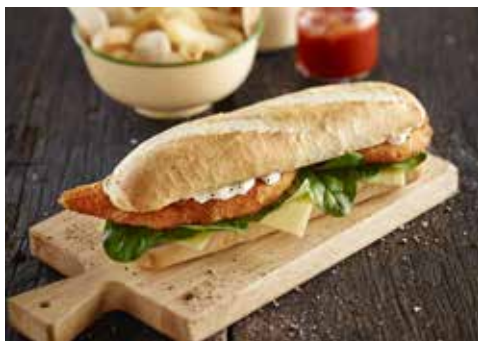
SPEEDIBAKE LARGE SANDWICH SUB WHITE