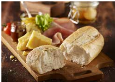
SPEEDIBAKE LARGE SANDWICH SUB WHITE – PAR BAKE