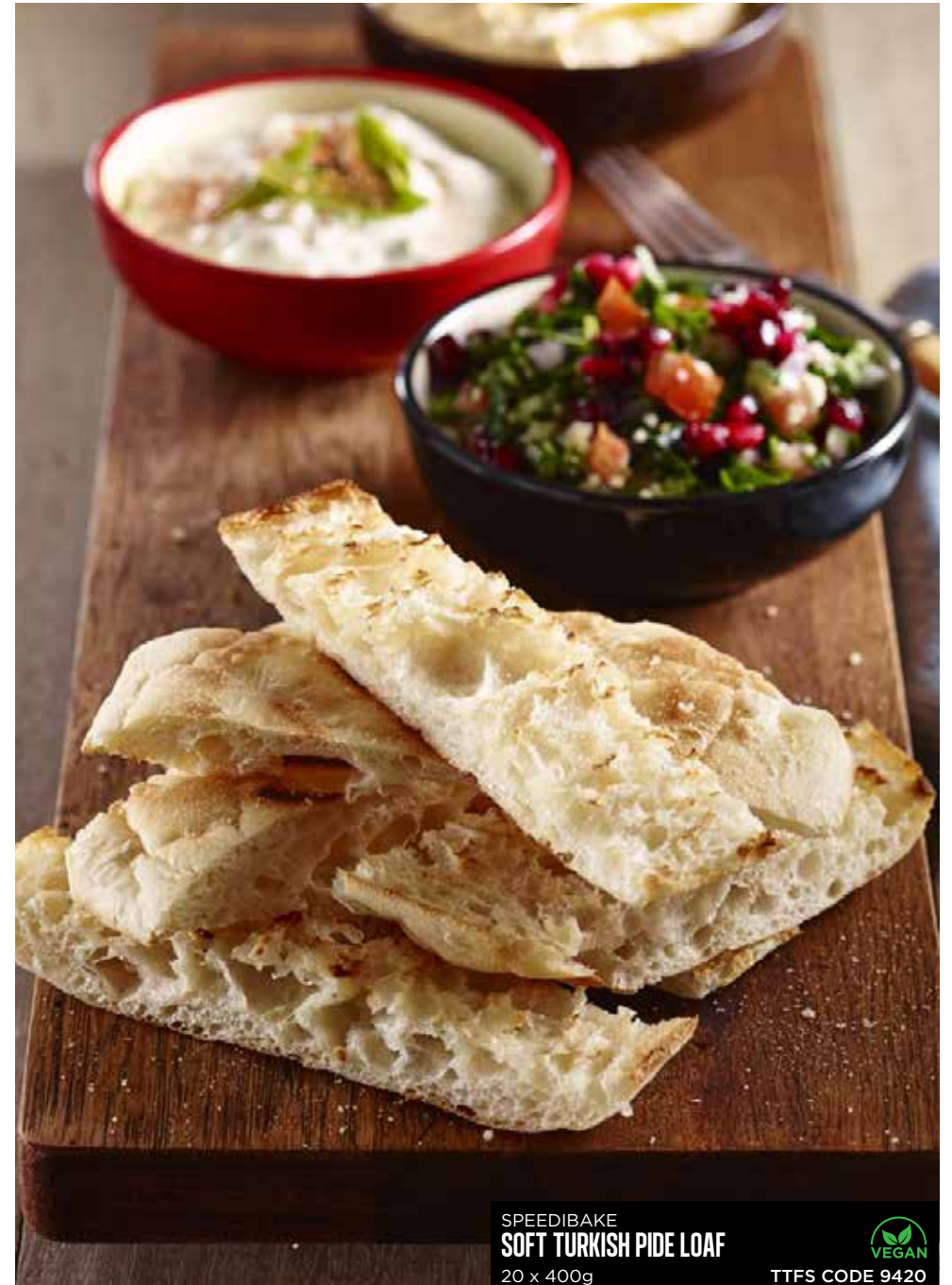
SPEEDIBAKE SOFT TURKISH PIDE LOAF 20 x 400g TTFS CODE 9420