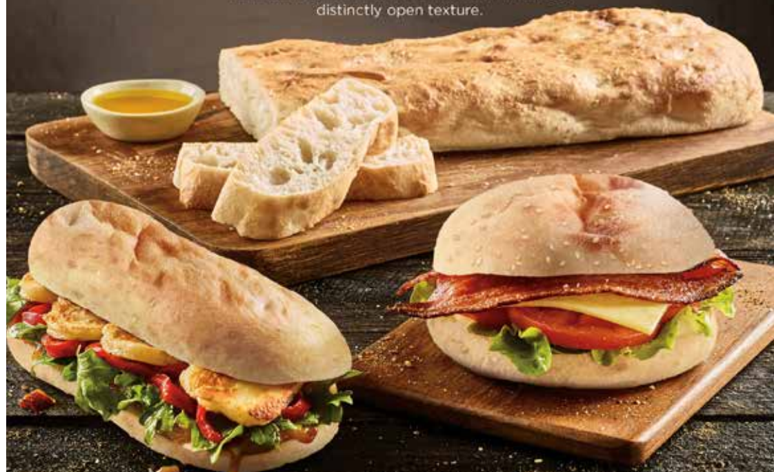
SOFT TURKISH ROUND LUNCH ROLL

But the secret to our perfectly leavened bread is stone baking each loaf at a high heat, creating a distinctly open texture.