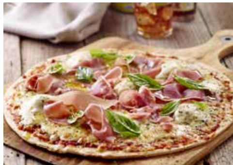
SPEEDIBAKE PIZZA BASE 12" 20 x 220g