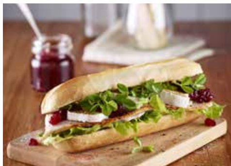
SPEEDIBAKE MEDIUM SANDWICH SUB WHITE