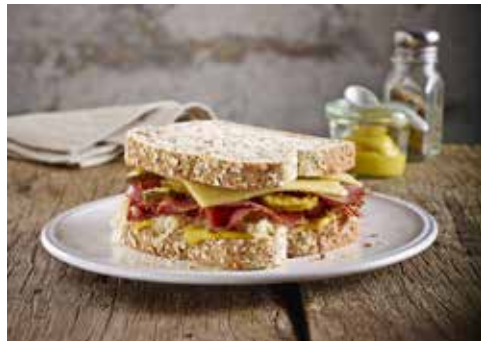
ABBOTT'S BAKERY COUNTRY GRAINS