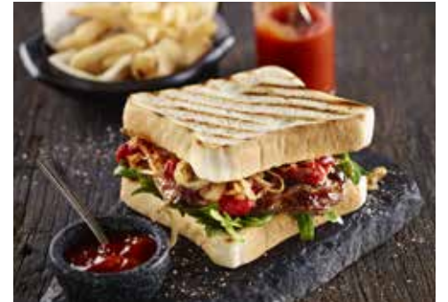
TIP TOP SUPER THICK WHITE SLICED