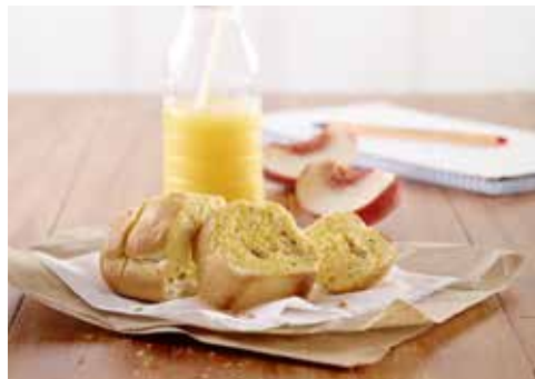
AGB GARLIC BREAD FOR ONE 4.5" 12 x 85g