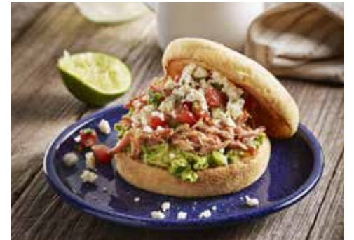
TIP TOP ENGLISH MUFFINS