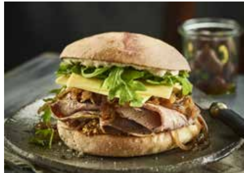
SPEEDIBAKE SOFT TURKISH ROUND LUNCH ROLL 70 x 130g