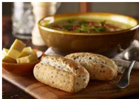
SPEEDIBAKE DINNER ROLL MULTIGRAIN