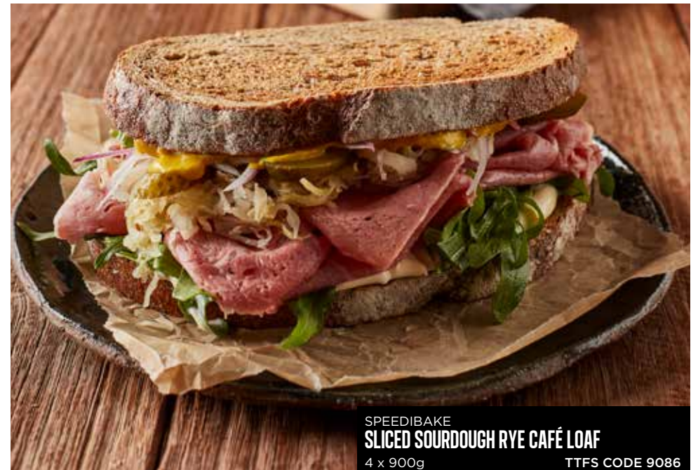
SPEEDIBAKE SLICED SOURDOUGH RYE CAFÉ LOAF 4 x 900g TTFS CODE 9086