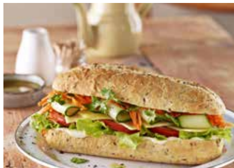
SPEEDIBAKE LARGE SANDWICH SUB MULTIGRAIN