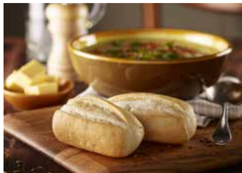
SPEEDIBAKE DINNER ROLL WHITE - PAR BAKE