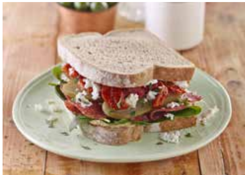
ABBOTT'S BAKERY LIGHT RYE