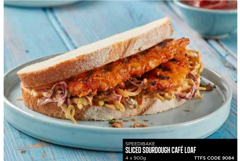
SPEEDIBAKE SLICED SOURDOUGH CAFÉ LOAF 4 x 900g TTFS CODE 9084