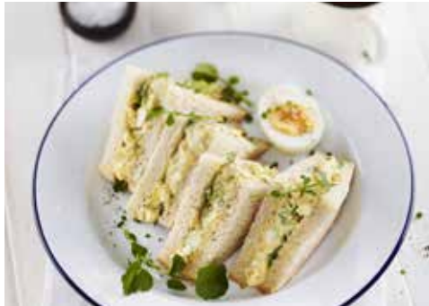
TIP TOP WHOLEMEAL SLICED