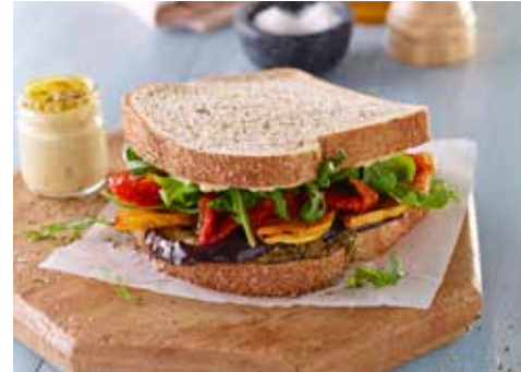
ABBOTT'S BAKERY FARMHOUSE WHOLEMEAL