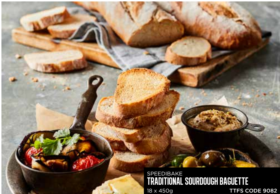
SPEEDIBAKE TRADITIONAL SOURDOUGH BAGUETTE 18 x 450g TTFS CODE 9082