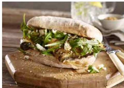
SPEEDIBAKE RUSTIC CIABATTA LUNCH ROLL 50 x 190g