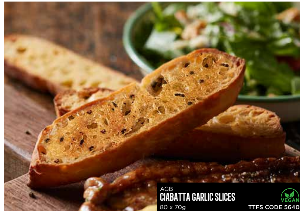
AGB CIABATTA GARLIC SLICES 80 x 70g