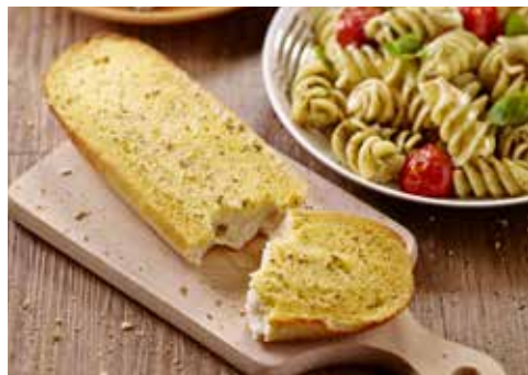
AGB GARLIC BREAD SUB 9" TWIN PACK 40 x 9" 125g pieces