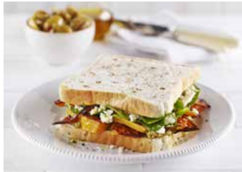
TIP TOP MULTIGRAIN SLICED