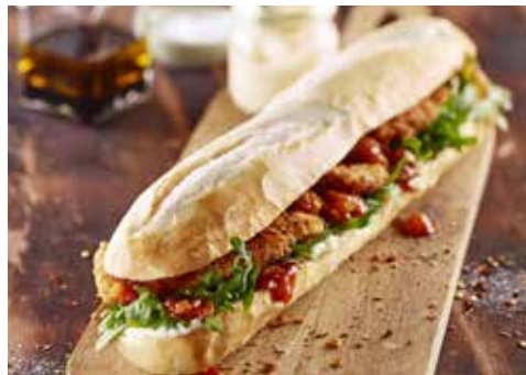
SPEEDIBAKE HALF BAGUETTE WHITE – PAR BAKE