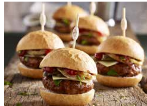
SPEEDIBAKE ROUND DINNER ROLL/SLIDER WHITE