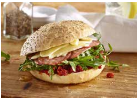
SPEEDIBAKE FOCACCIA LUNCH ROLL 50 x 120g