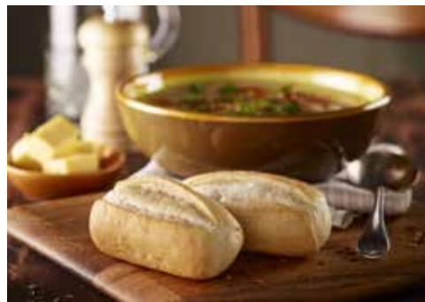
SPEEDIBAKE DINNER ROLL WHITE