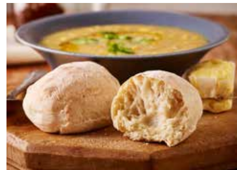
SPEEDIBAKE CIABATTA DINNER ROLL/SLIDER