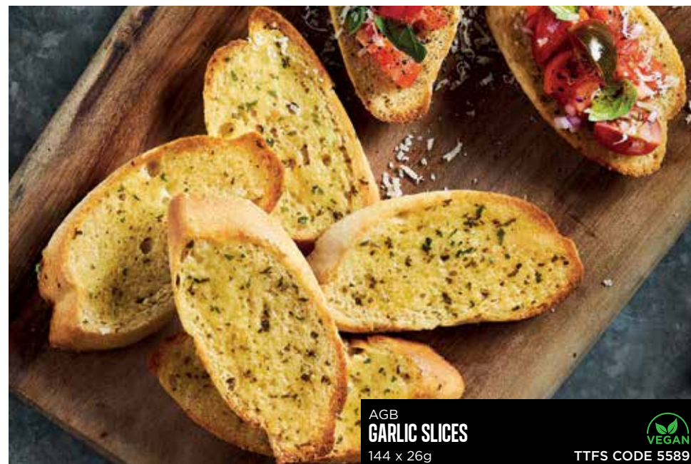
AGB GARLIC SLICES 144 x 26g