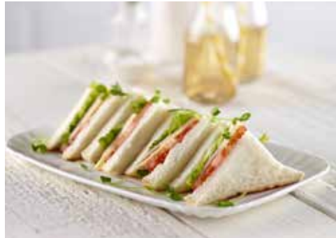
TIP TOP WHITE SLICED