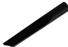
Crevice Tool 16019002