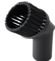
Dusting Brush 16019003