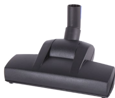
Turbine Brush 16019005