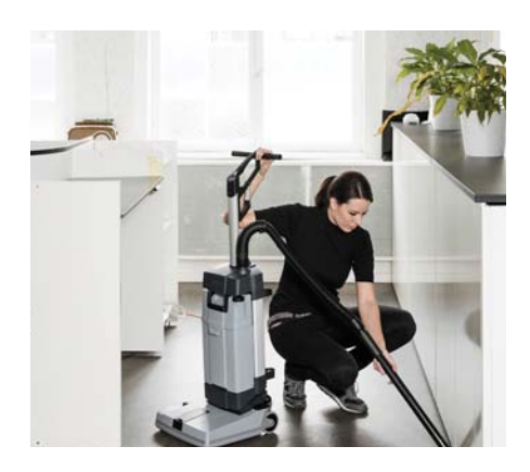
The optional manual suction hose is ideal for cleaning any hard to reach area or spot cleaning.