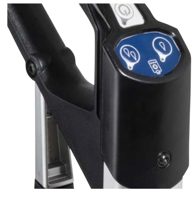
Stay in full control of the scrubber dryer thanks to the intuitive touch display with two water settings and a solution indicator, alerting you when the tank is empty.