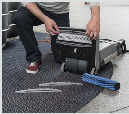
Apart from faster cleaning of hard floors, you can also freshen up smaller carpets, including removal of spots, by adding an optional carpet kit. Brush and squeegees can be removed without any tools, making daily maintance operations easy and fast.