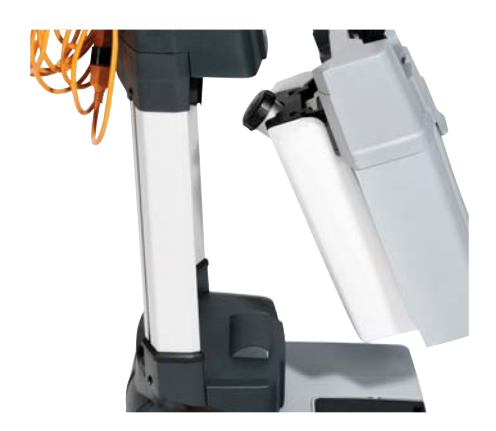
Tanks can be removed quickly and carried in one hand.