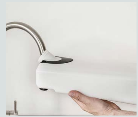
Easy to fill the solution tank with water in any low sink.