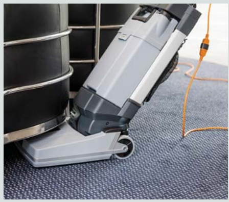
The SC100 needs just 25 cm clearance for cleaning.