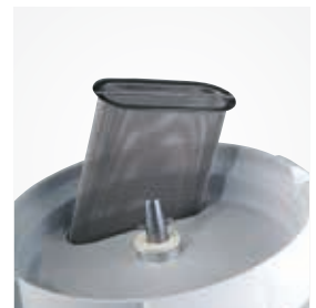
Removable stainless steel filter