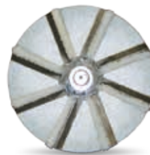
Washing plate (optional)