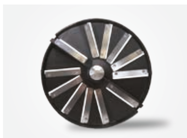
Knife plate (optional)