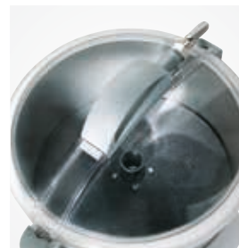
Transparent lid with spray gun