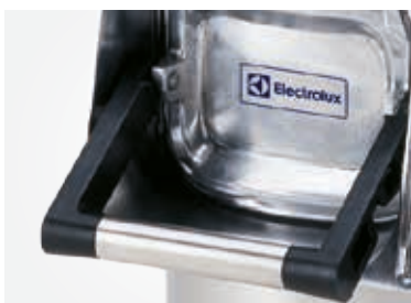
Ergonomic handle and outlet