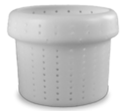
Drying basket (optional)