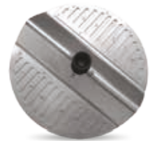
Seashell plate for TM models