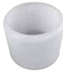
Drying basket (optional)