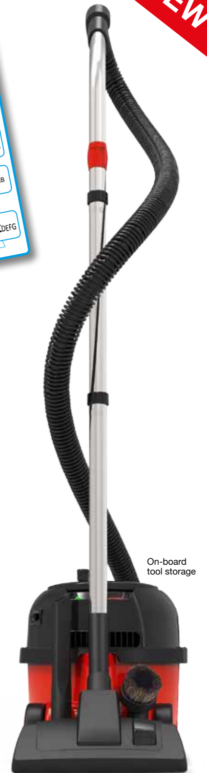
On-board tool storage