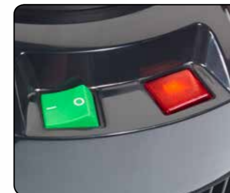
On / Off power indicator