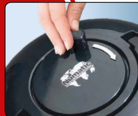
10m cable rewind and storage system