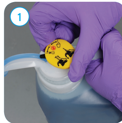
1 Turn the control knob to select the appropriate icon.