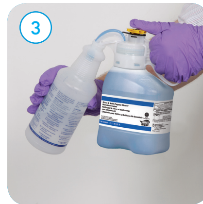
3 Push the knob down fully to pump a precise dose of concentrate needed for the correct dilution when mixed with water.