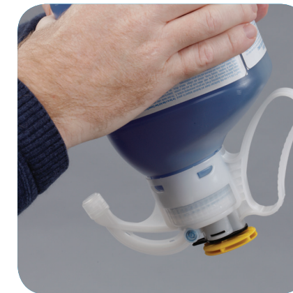
Patented Spill-Tite™ sonically-welded head eliminates leaking of concentrate.