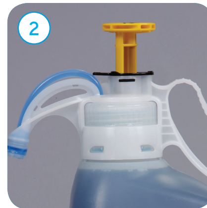
2 Pull up on control knob one time to prime the pump.