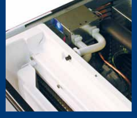
The LuminIce space-saving design fits inside the ice machine so existing exterior clearances are not impacted. In addition, power for the unit is supplied through the ice machine's internal electrical supply so outlet space is conserved.

The LuminIce device runs quietly 24 hours a day keeping your ice machine cleaner and helping to relieve the stress and pain of frequent cleanings due to challenging foodservice environments where yeast, flour, sugars, and other contaminants create an environment favourable to growth. Reduced cleanings ultimately saves labour time, cost, and machine downtime during the cleaning process.