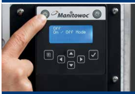
Service data display