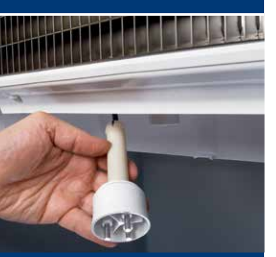
Snap-fit water probe