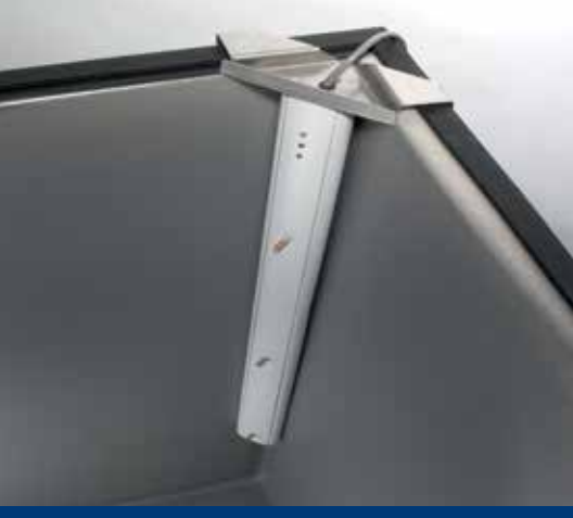
Bin Level Control Sensor