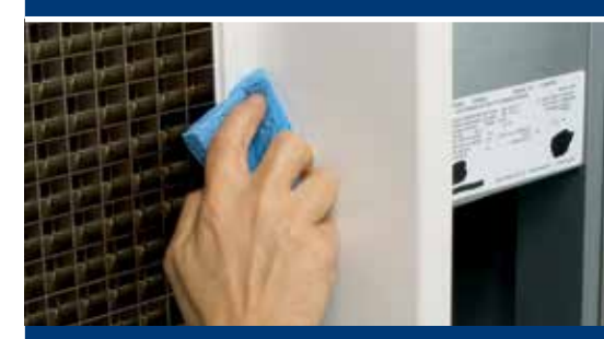
The foodzone edges have soft, rounded corners that wipe clean quickly and easily.