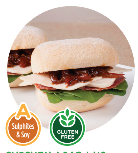
CHICKEN LOAF 4KG

Product Code 5130200 Carton Contents 4 x 2.5kg